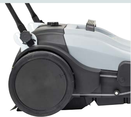
The handle can be adjusted to fit the height of the operator (3 positions)