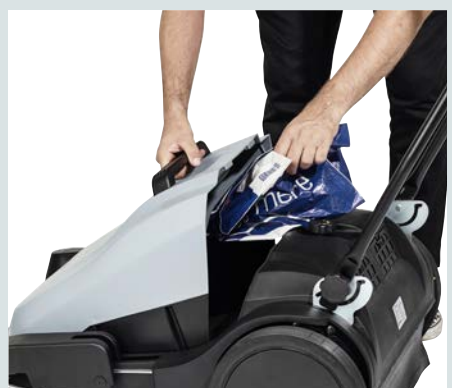
The hopper can stay in an open position so it is easy to throw big items or empty a rubbish bin into the hopper