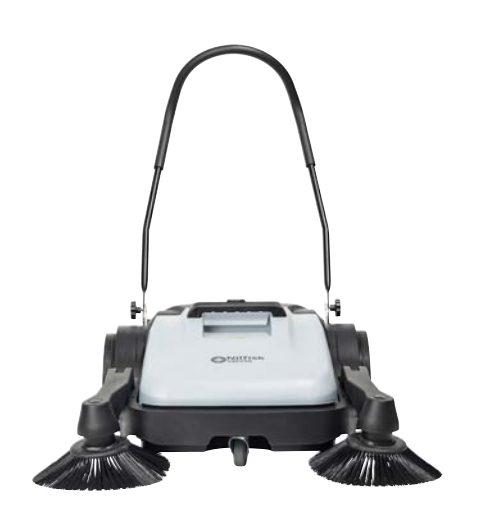
SW200 with one side broom – and SW250 with two side brooms – cover working widths of 70 cm and 90 cm.