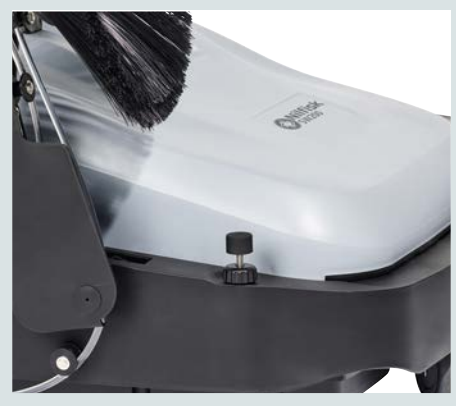
Both the main broom and the side brooms can be adjusted without using tools